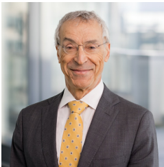
Seth P. Waxman