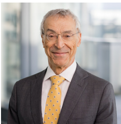
Seth P. Waxman