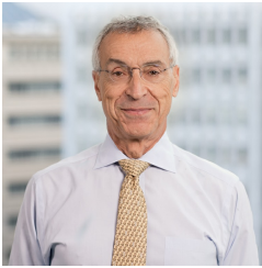
Seth P. Waxman