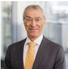
Seth P. Waxman