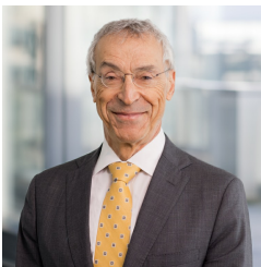
Seth P. Waxman