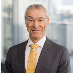
Seth P. Waxman