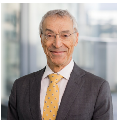
Seth P. Waxman