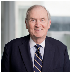
Ambassador Robert M. Kimmitt