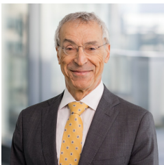
Seth P. Waxman