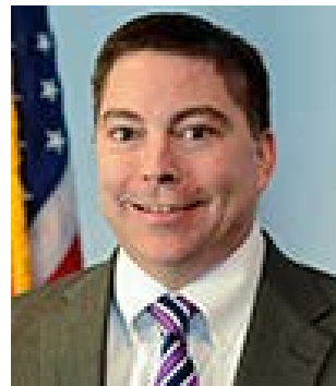
Michael O'Rielly (R), Term: January 29, 2019