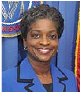
Mignon Clyburn (D), Term: July 1, 2017