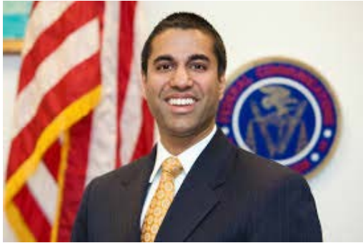
Ajit Pai (R), Term: May 7, 2017